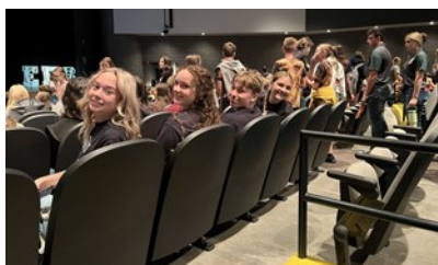
Student Council as Regional Conferences

With some handbook changes, students are adjusting to new requirements. However, students and staff have been incredibly receptive of the changes, and we are seeing quality results with some of the new academic standards. Our math and English language arts MTSS programs continue to help develop student achievement in these areas as the year progresses. Fall MAP testing has been completed, staff continue to use data to help monitor and adjust educational practices to benefit student learning.