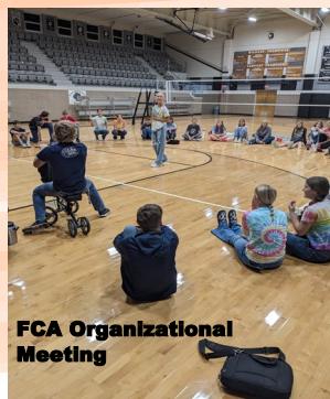
FCA Organizational Meeting

A nationally affiliated club that focuses on coaches/athletes and teams: engaging, equipping and empowering individuals within their communities to inspire change through the gospel. NHHS students requested the start of FCA as another avenue for student involvement and to serve students across our school and community. Although still in its infancy, turn out and interest in the club have been outstanding.