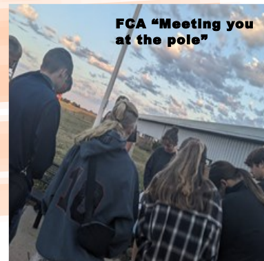
FCA "Meeting you at the pole"