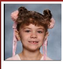
Coralyn Hager Kindergarten