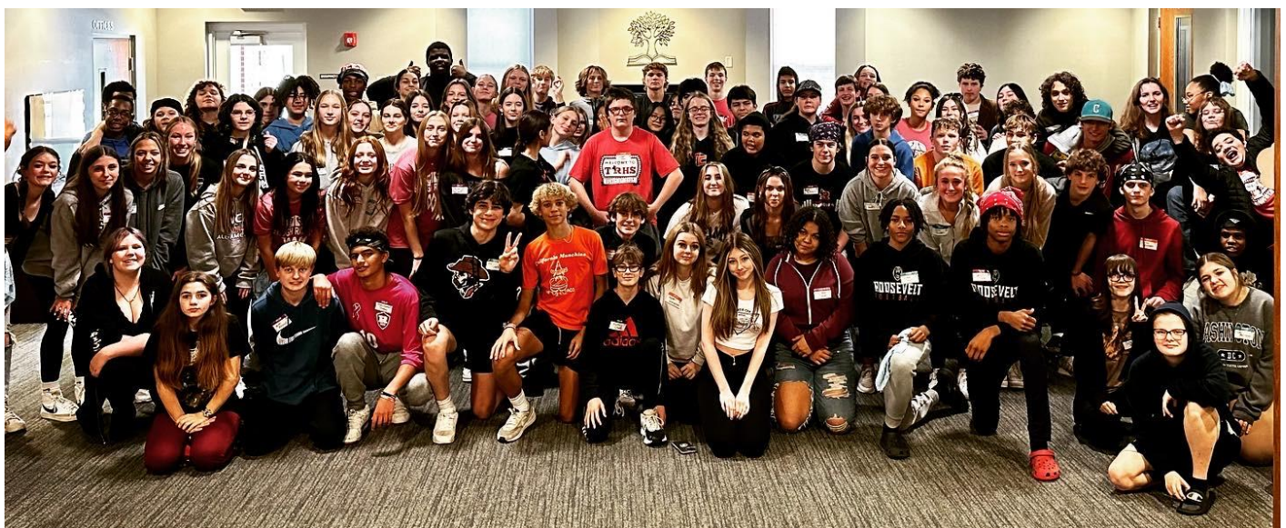
Freshmen Students at the Freshman Retreat - November 2023