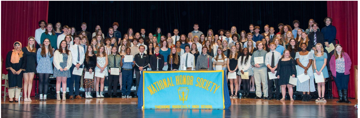
National Honor Society Induction - November 2023