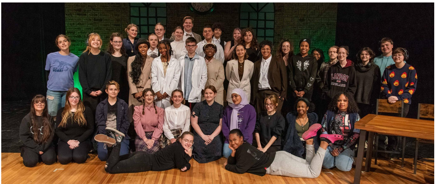
TRHS Drama Guild presents the Radium Girls Cast and Crew - November 2023