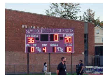
Football New Rochelle 6 vs. Suffern 28