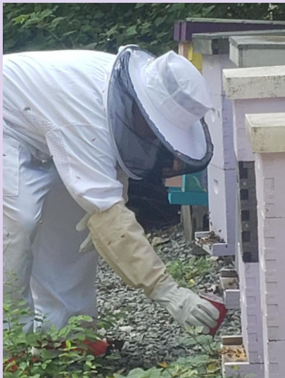
Six New Rochelle High School students participated in a four-week STEM initiative