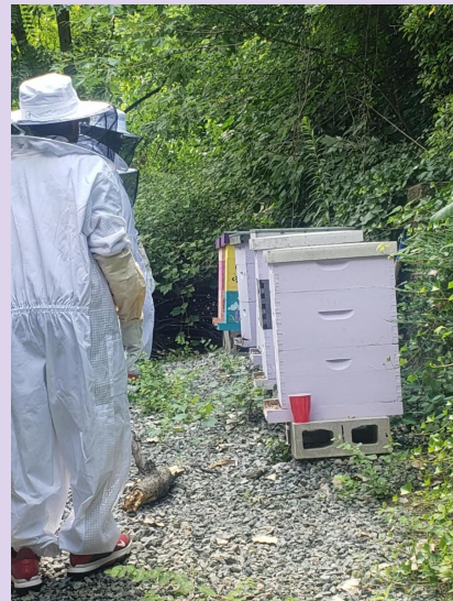
“It will provide an environment where students can learn hands-on how to care for