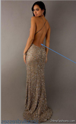
Back too low