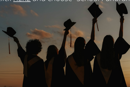
Photo available through Visual Image Photography (VIP). Fee $30. To order click HERE and choose "School Panoramics".

Friday, May 17th at Graduation Rehearsal