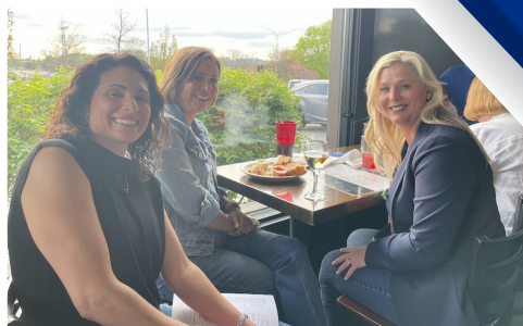
Panther Alumni and Friends gather in KC at an annual Panther Pride gathering.