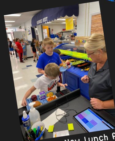
Learning New Lunch Pins