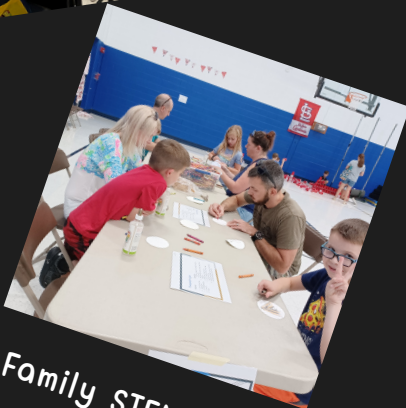
Family STEM Night