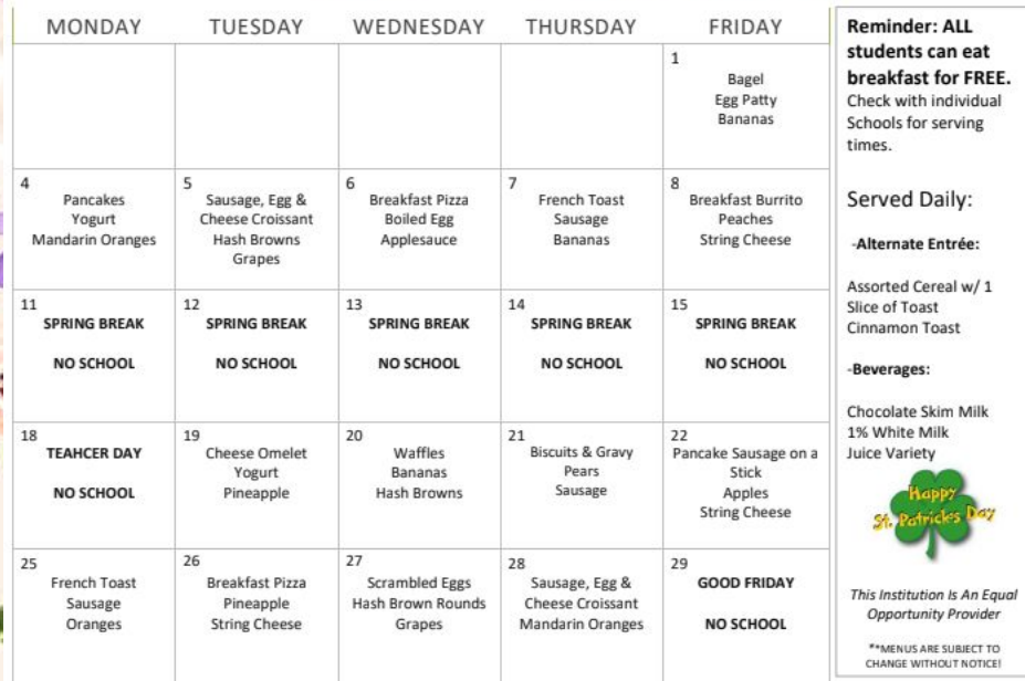
SAN JUAN SCHOOL DISTRICT ELEMENTARY SCHOOL BREAKFAST