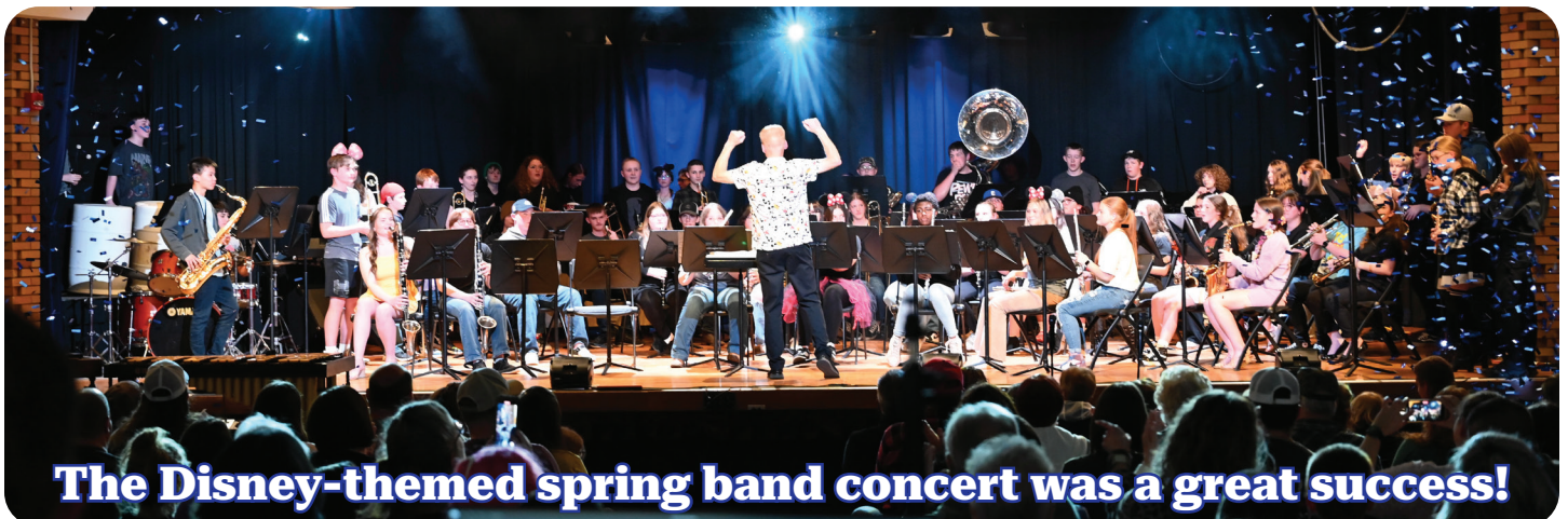
The Disney-themed spring band concert was a great success!

for student programs, electives, and extra-curricular activities, or to put towards future projects. Visit https://www.midlandfoundation.org/fund/coleman_schools_endowment/ to make a donation.