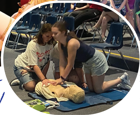
Pictured: Drama Club's performance of "Cinderella," Drive Your Tractor to School Day, and 9th Grade Health class learning CPR