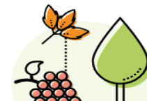
Agriculture, Food and Natural Resource