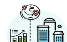
Business and Administration