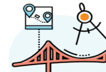
Architecture and Construction