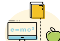
Education and Training