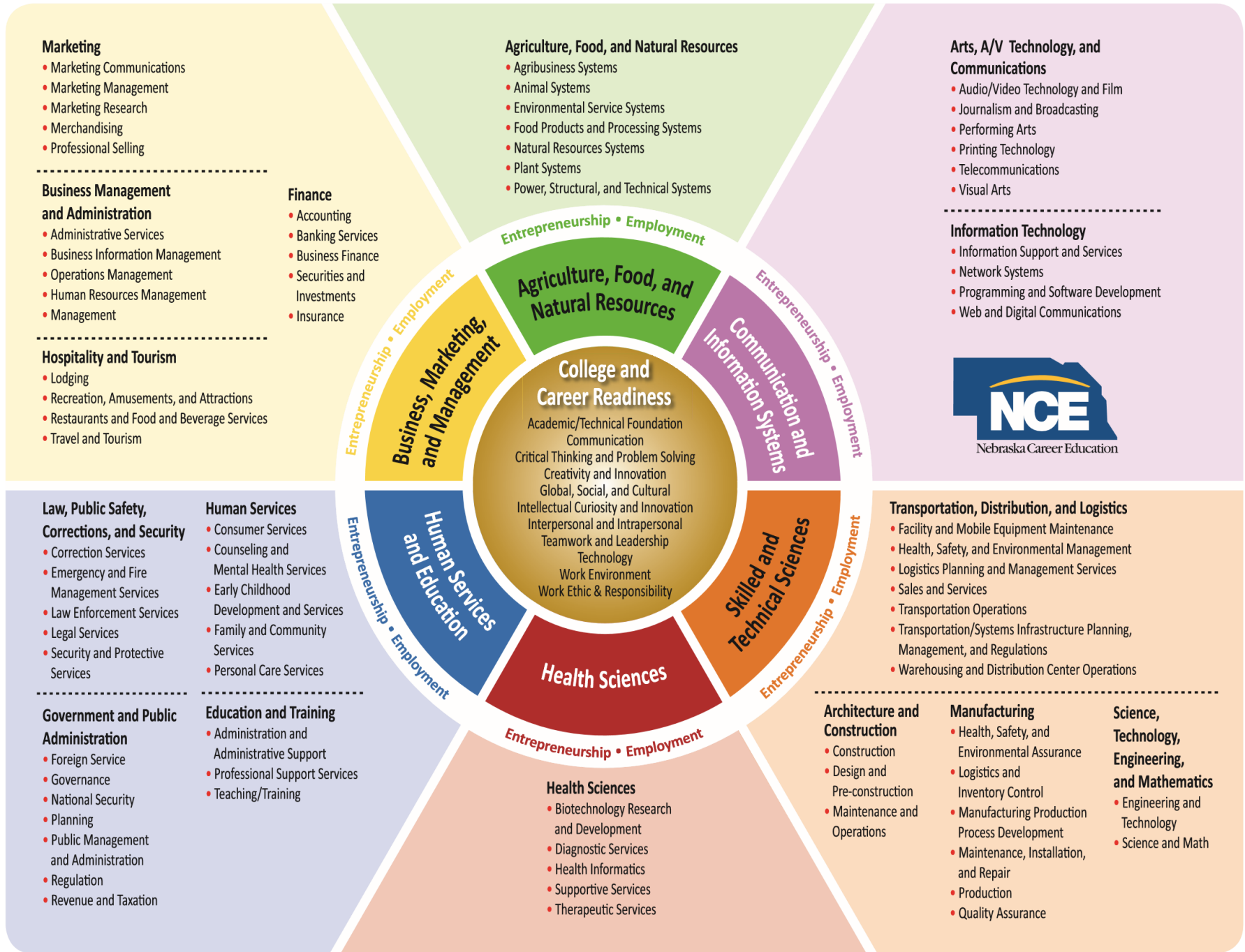
PATHWAYS MODEL DIAGRAM