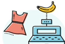
Marketing Sales and Service