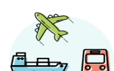
Transportation, Distribution, and Logistics