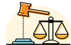
Law and Public Safety