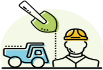
Hospitality and Tourism