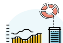
Finance and Insurance