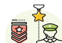
Government and Public Administration