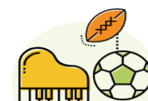
Arts, A/V Technology and Communication