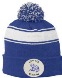
Blue and white beanie-$17

Patches will be white with ALL BLACK image. Not blue as pictured.