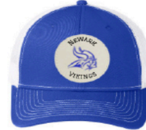
Blue and White cap-$20