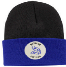
Black and blue beanie-$17