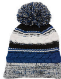
Tri color beanie(no patch) -$17