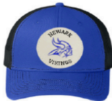
Black and blue cap-$20