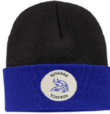
Black and blue beanie-$17