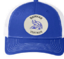
Blue and White cap-$20