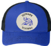
Black and blue cap-$20