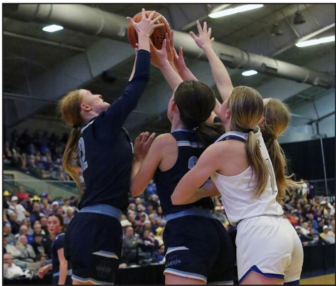
State Class A Tournament photos courtesy of South Dakota Public Broadcasting.