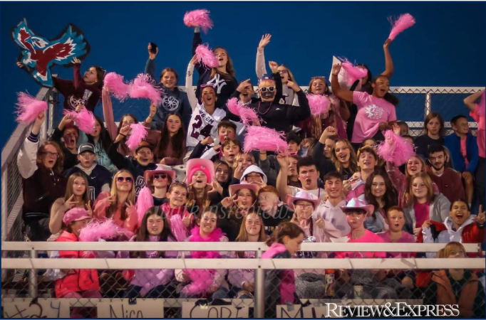
Schuyler Storm fans showing their spirit by participating in a "pinkout" to wrap up spirit week.