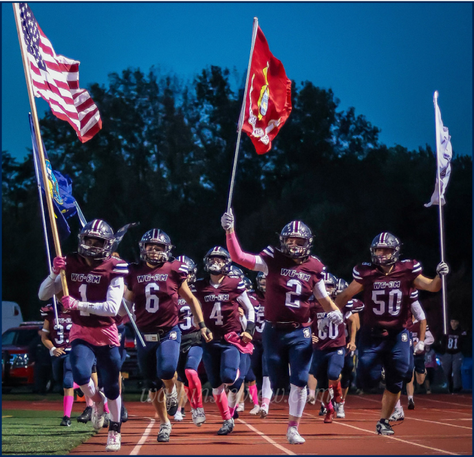
The football team STORMing the field before kickoff.