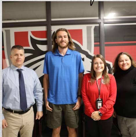
Pictured from Left to Right