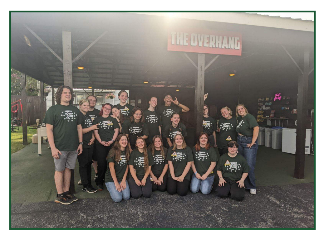
The Pioneer High School Chamber Choir opened a summer concert at Darien Lake.

The Pioneer High School Chamber Choir performed this summer at Darien Lake Performing Arts Center.