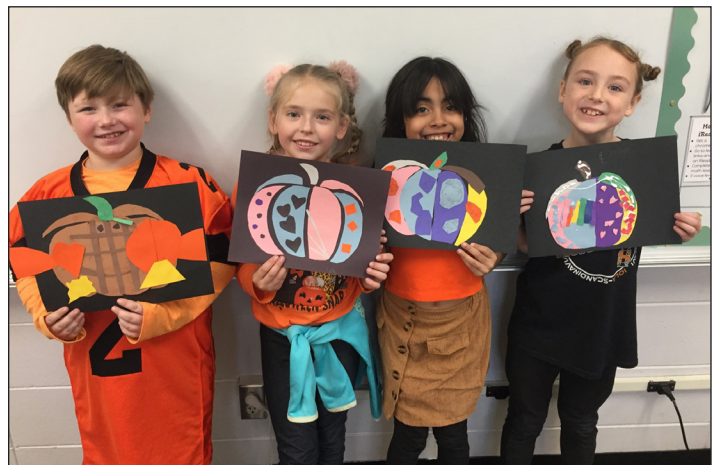
Look at this gourd-geous Pumpkin Patch our elementary school students created!