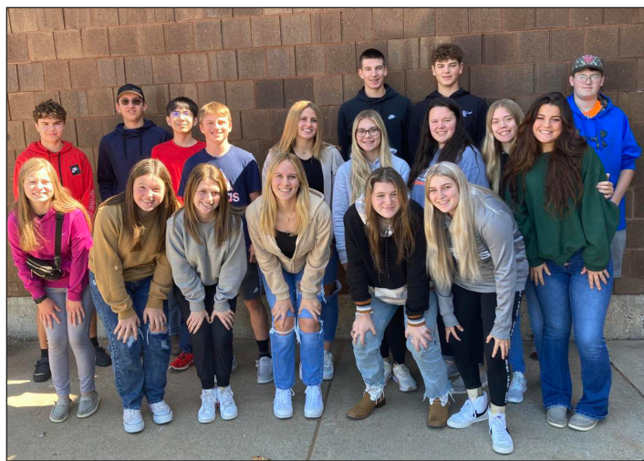
The high school yearbook staff visited Wisconsin Rapids to work on ideas for this year's book.