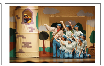
Theater brings play, humor, and laughter to learning.