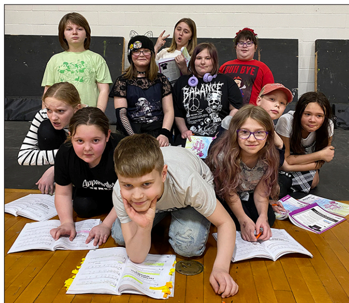
The cast and crew of Willy Wonka Kids hard at work during rehearsal.