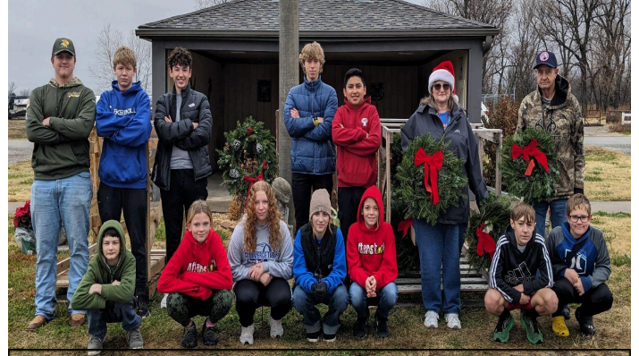
Placing wreaths at the veterans cemetery,