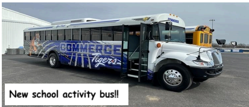
New school activity bus!!