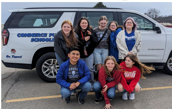
Academic Team went to Districts on January 23rd and regionals on February 10th. They made it to the third round of the regional tournament.