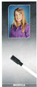
Dry Erase Locker Magnet