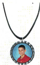
Bottle Cap Necklace