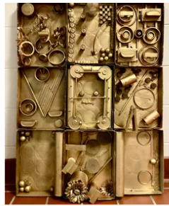
GT Student collaborative project - Made inspired by Louise Nevelson's Artwork