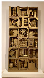
Louise Nevelson: Title-Royal Tide 1, 1960, painted wood, 86 x 40 x 8 inches.