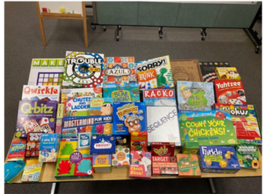
Some of our games !