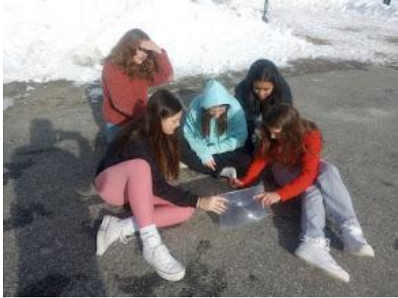
Friday was a "Fun Friday" day. Here's a team working to build a fire with a concentrating lens.