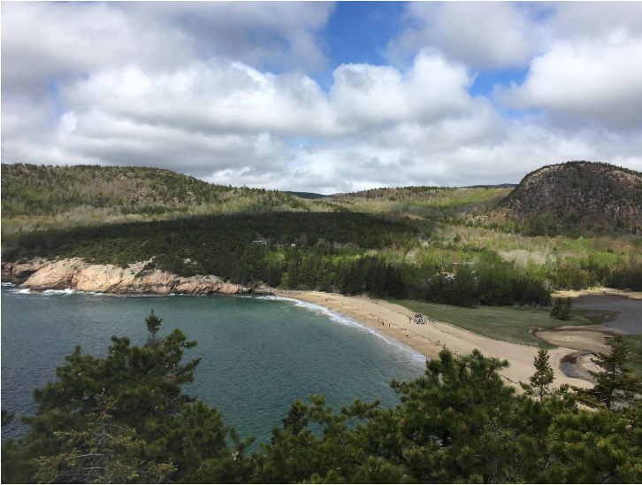
Sand Beach, Spring 2019